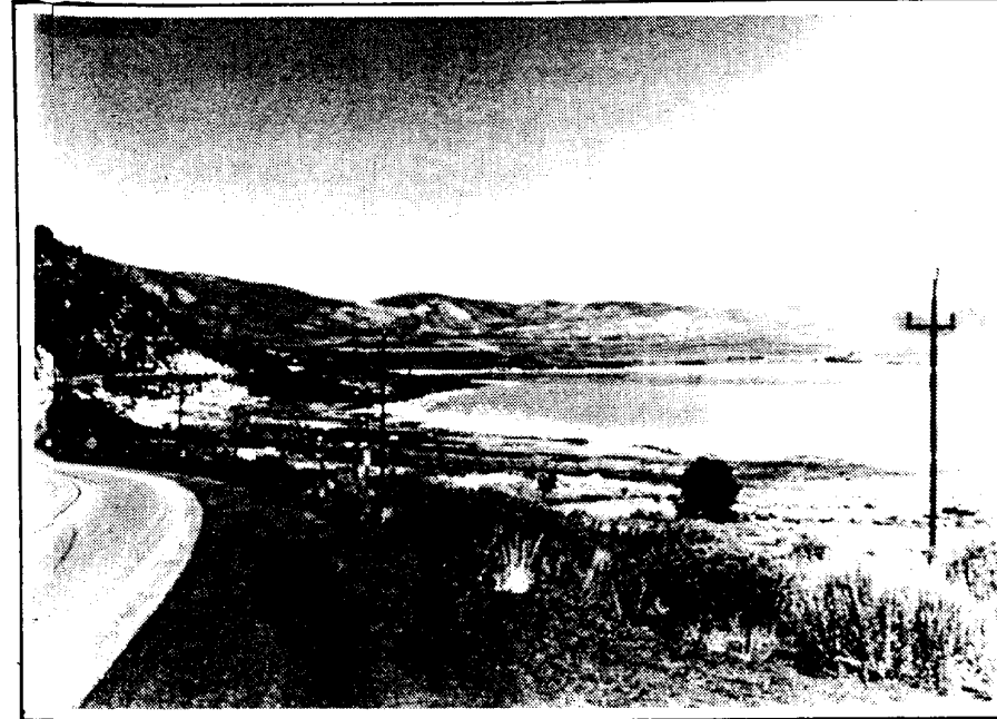
6,374.5' (lake level as of August 1991)