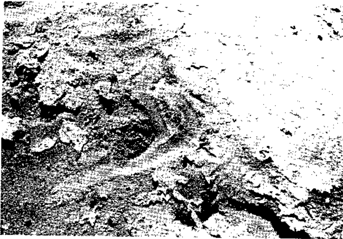
Thin, firm salt crust, upper end of salt deposits