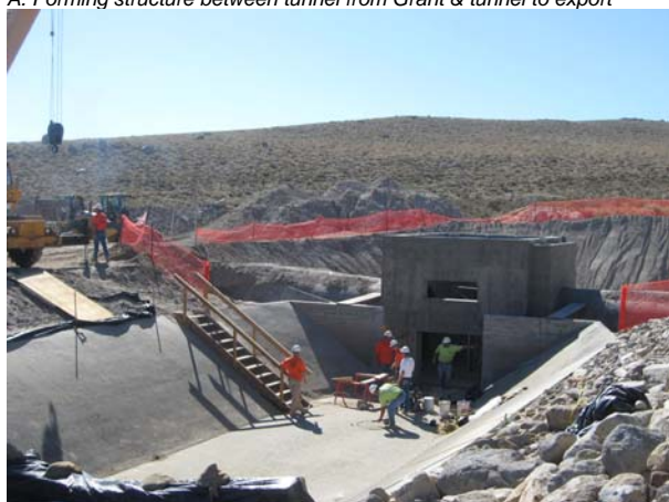
C. Forms removed. Return ditch in the foreground