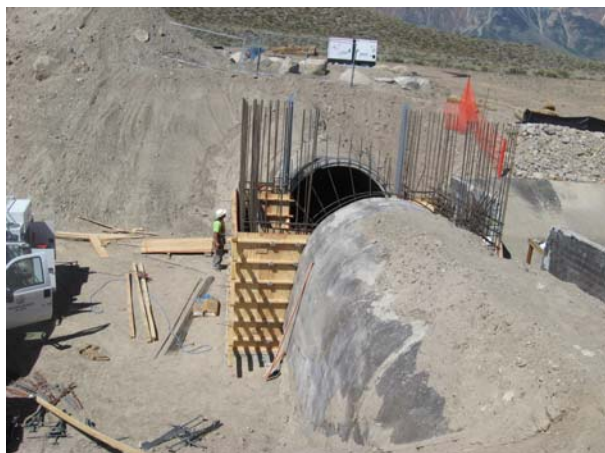
A. Forming structure between tunnel from Grant & tunnel to export

Export was halted for this work but flow to the MGORD was maintained through the bypass pipe that was installed in 2008 for that purpose. The new Mono Gate One is up and running but the facility still has to be covered with an outer building similar to its original look and that will be installed this spring.