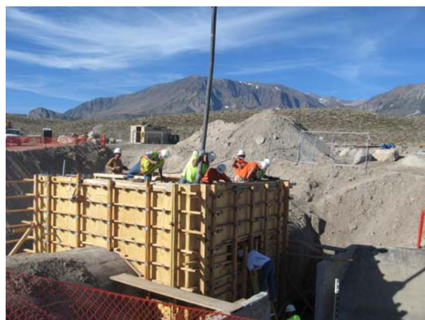
B. Pouring concrete in the form